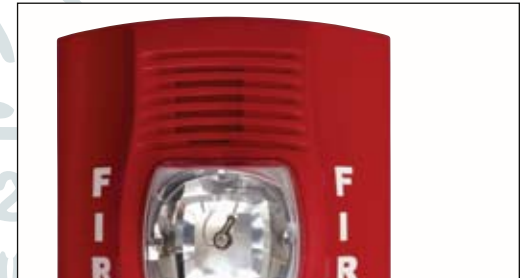
2- and 4-wire horn/strobes available to meet local code requirements