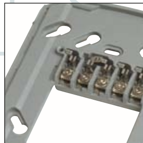
Same mounting plate for wall and ceiling