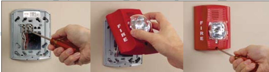
Plug-in design allows pre-wiring and continuity check prior to device installation