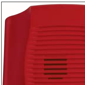
Horn rated at 88+ dbA at 16 volts