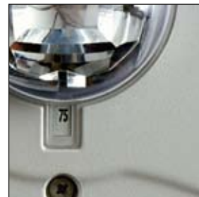
Field-selectable candelas up to 185 cd