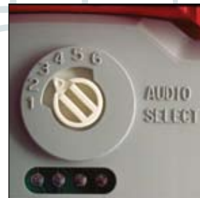
Rotary switch for horn tone selection