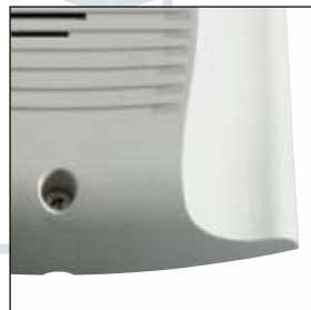
Captive mounting screw