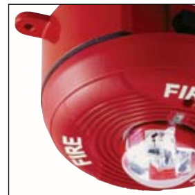
Wall and ceiling outdoor products